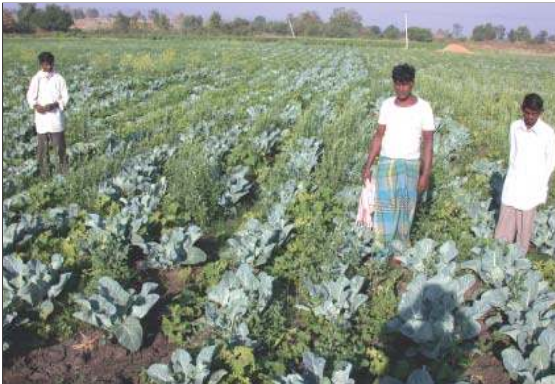
Figure 5. Cauliflower grown for the first time in Powerguda with irrigation.