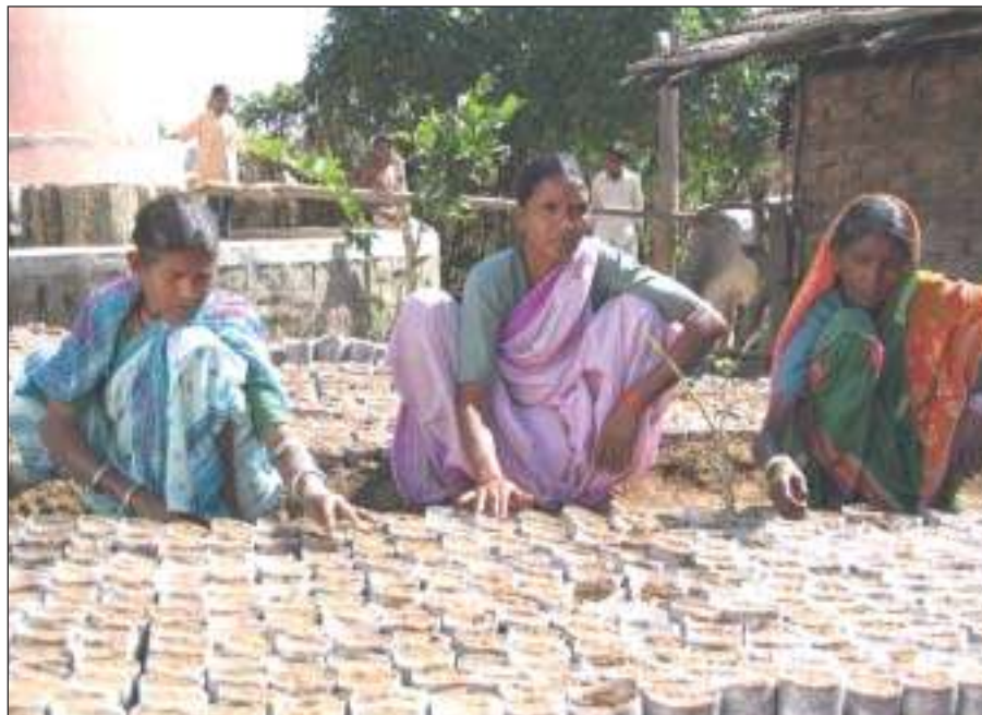
Figure 6. Women of Powerguda prepare polyurethane bags to establish pongamia saplings. (Note: The pongamia nursery has become a new income-generating activity in the village.)

1. The incomes have been calculated in constant rupees using 1999–2000 as the base year. Incomes for 2002 were adjusted for inflation at the rate of 4% per year.