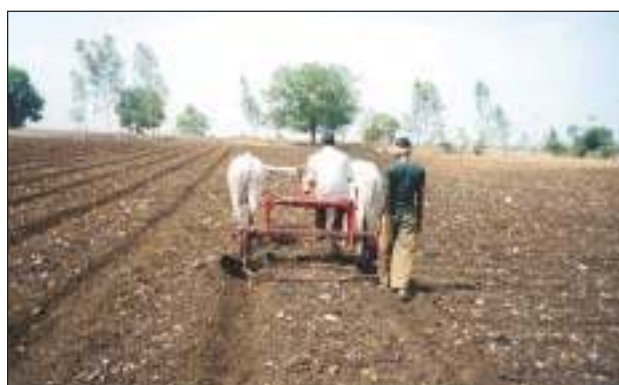
Figure 3. Broad-bed and furrow landform for improved drainage.