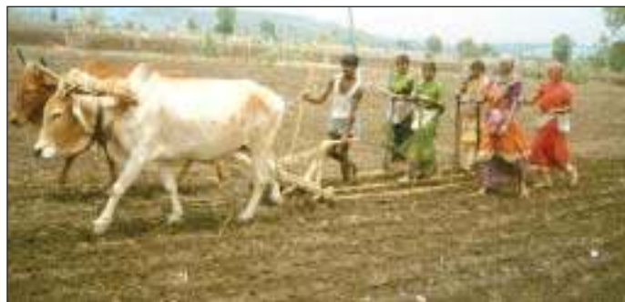
Figure 2. Farmers use a traditional method of planting in which seeds and fertilizer are mixed together.