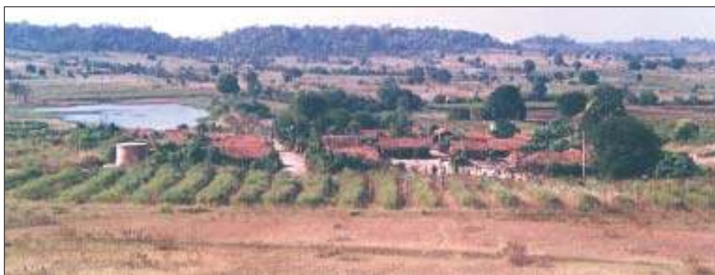
Figure 7. Thatched houses in Powerguda in 2001.