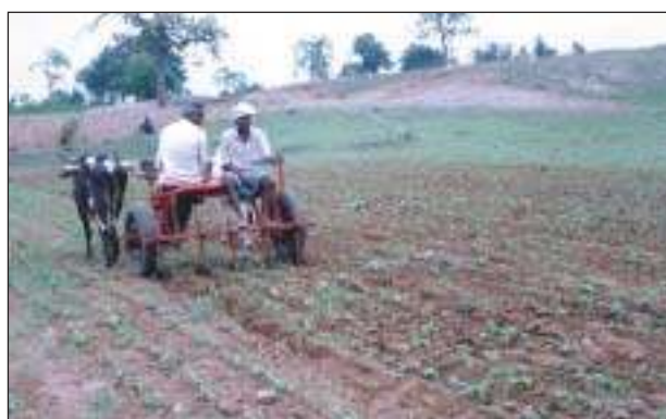
Figure 4. Tropicultor used for planting, fertilizing and covering seeds in a single operation.