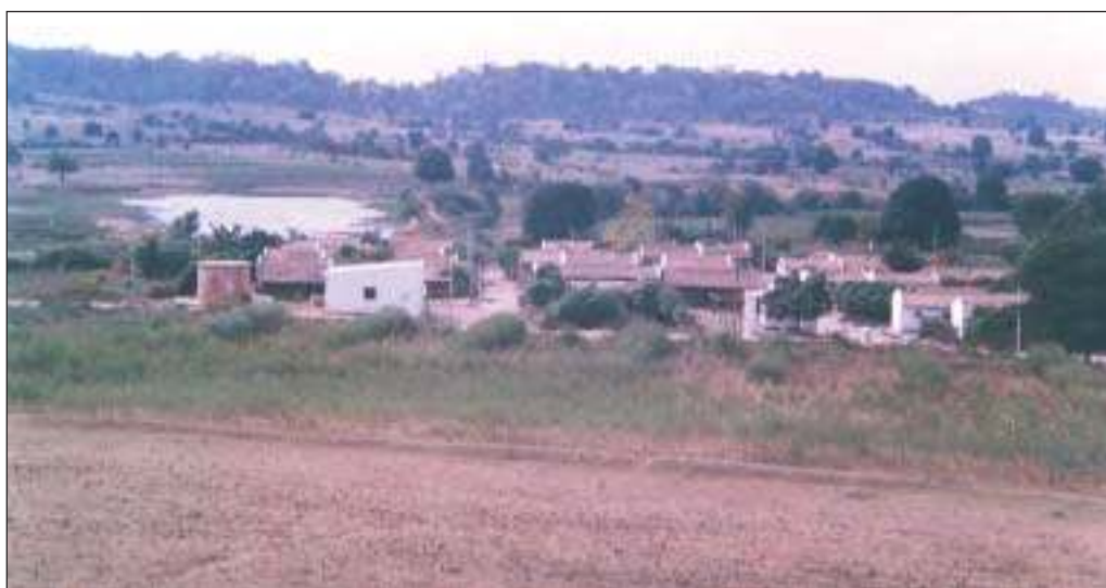
Figure 8. New brick houses in Powerguda in 2003.

(Note: The houses were built by local residents by combining their own funds with government grants indicating a level of self-confidence and financial maturity.)